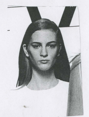
Tooskinny? or Sexy?

· 71.5% of women are terrified of being overweight.